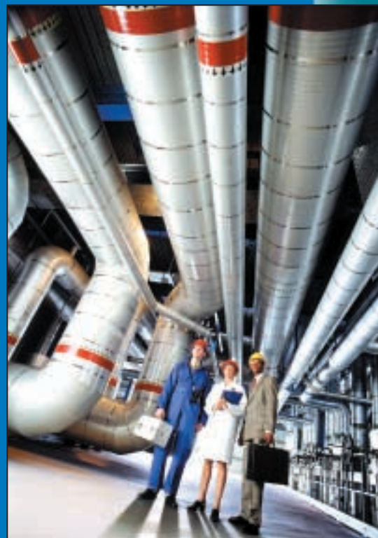
An appraiser utilizes the information supplied by a facility's engineering staff as well as data gathered during a facility walk-through.

► Insulation is a seriously under-utilized, but proven technology solution that can save energy, reduce fuel costs and a facility's impact on the environment. The role of insulation in energy efficiency and environmental preservation is clear. Every time a system is insulated it improves the energy efficiency of a facility and reduces the level of emissions of greenhouse gasses into the atmosphere. From an economical point of view, thermal insulation simply makes good business sense. A properly selected, specified and installed thermal insulation system can, in many cases, provide an excellent return on investment through cost savings.